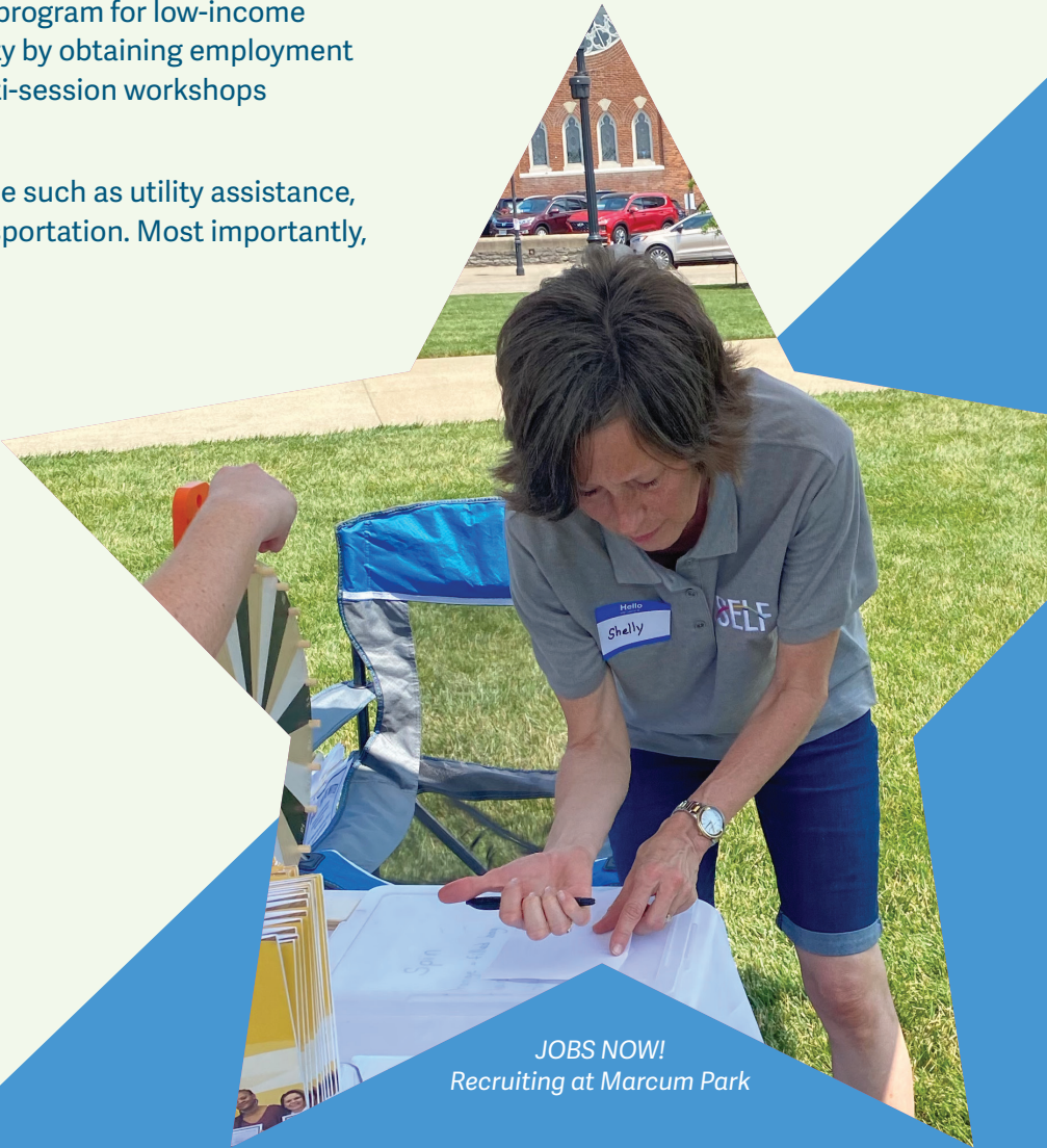
JOBS NOW! Recruiting at Marcum Park

32 JOBS NOW! graduates gained employment in 2021