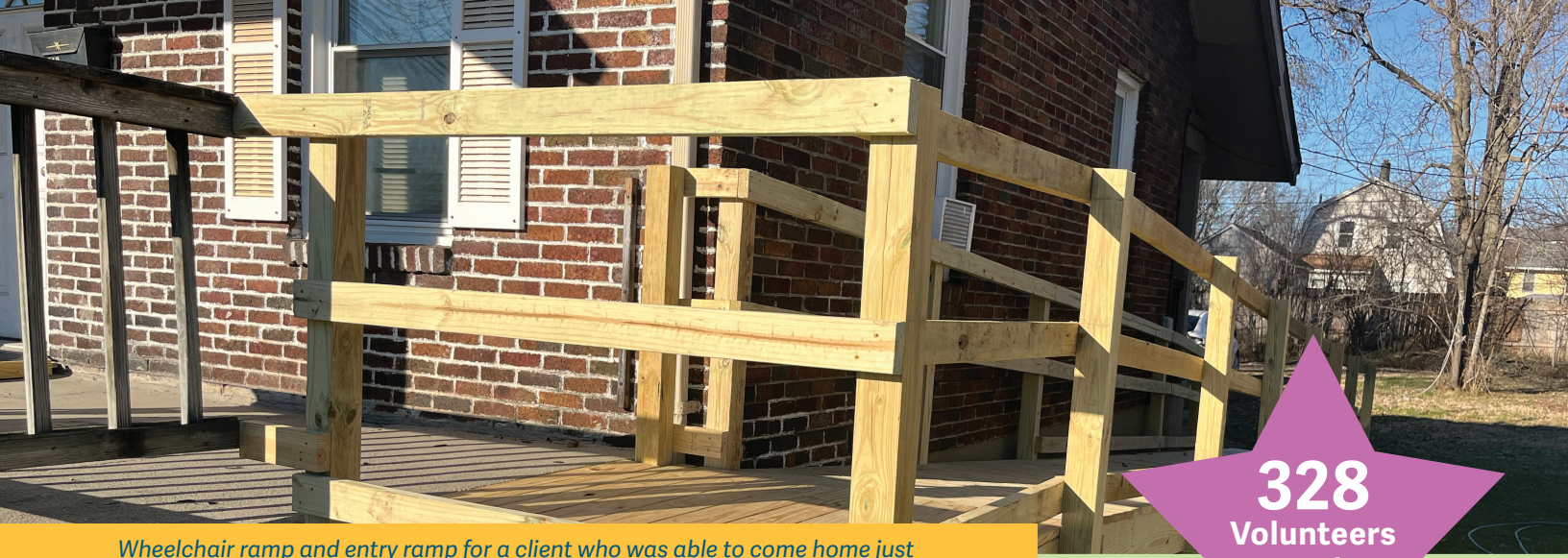
Wheelchair ramp and entry ramp for a client who was able to come home just in time for Christmas after spending more than a year in a rehab facility