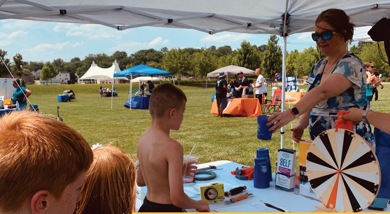
SELF at a Father's Day event at Marcum Park in Hamilton