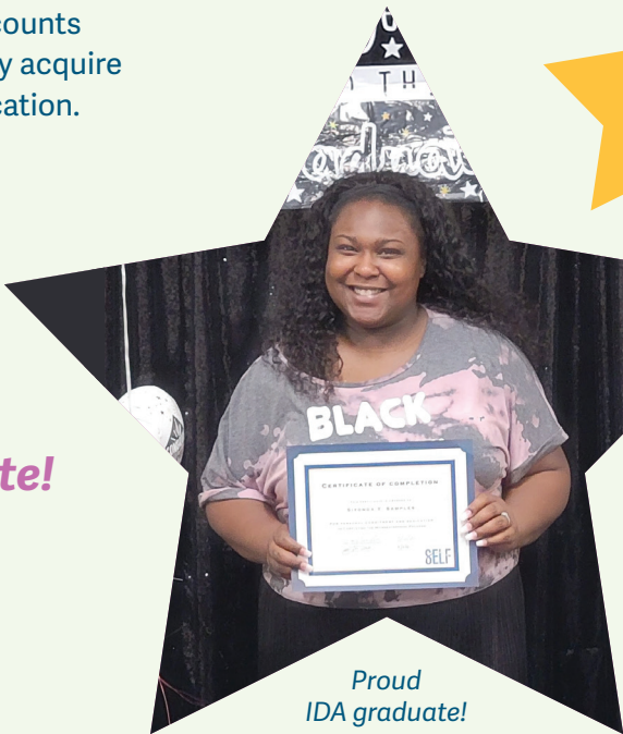
Graduating IDA class