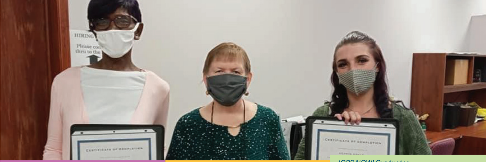
JOBS NOW! Graduates