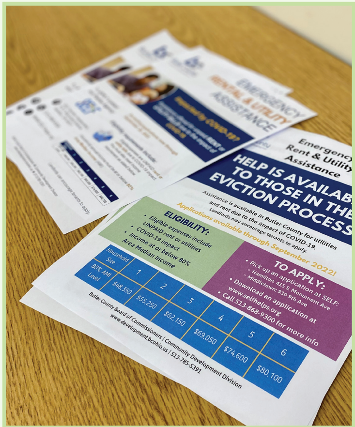
Emergency Services flyers

with rent, utility, and mortgage assistance, keeping their lights on and potentially keeping them off the street.