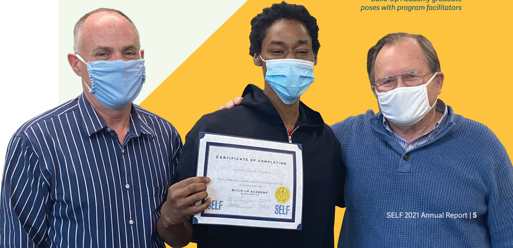
Build-Up Academy graduate poses with program facilitators