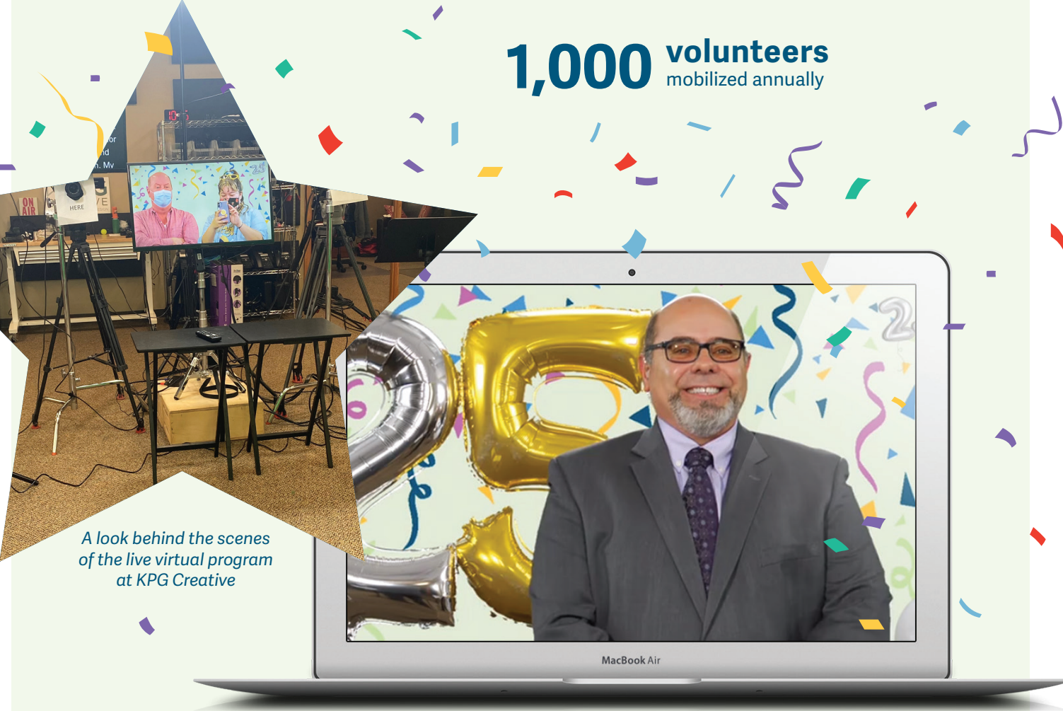
A look behind the scenes of the live virtual program at KPG Creative