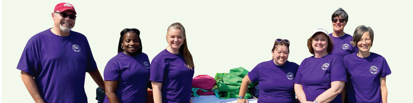
SELF at a bookbag giveaway at Sonny Hill in Middletown

20 clients increased social bridging, a way of expanding their resource network