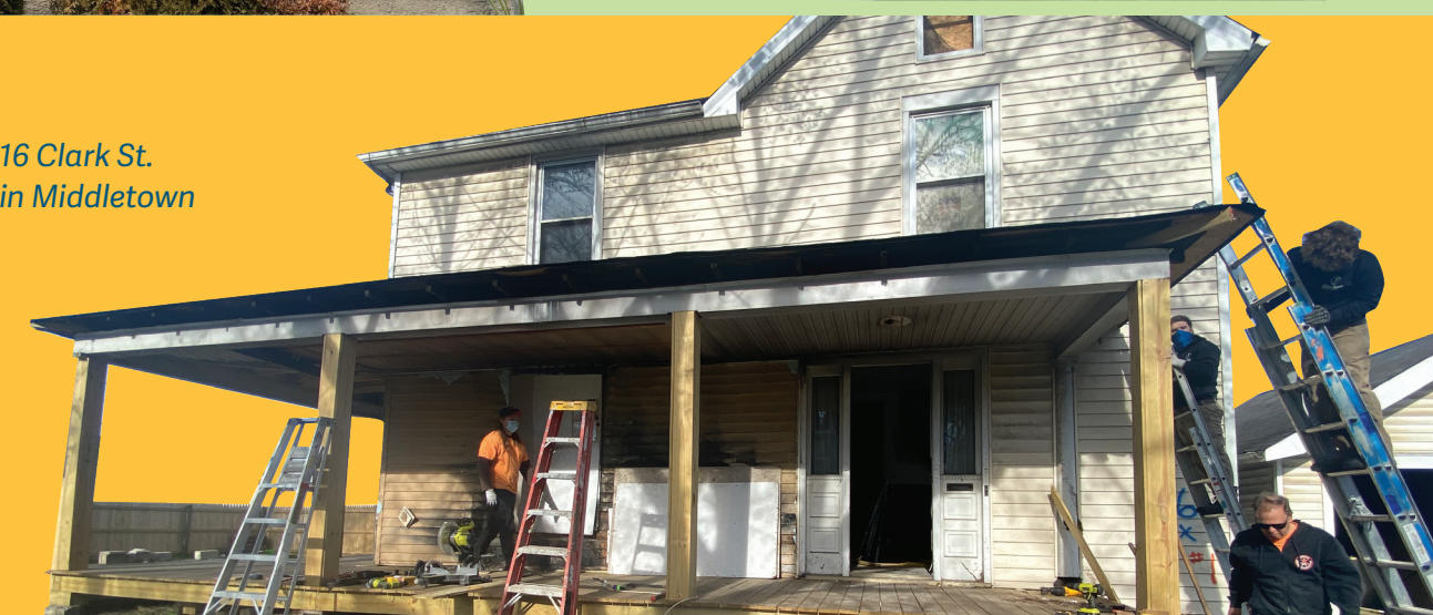
16 Clark St. in Middletown